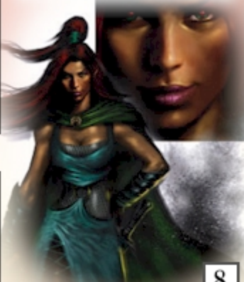
The Gregarious Neighbor