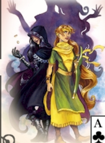
The Small Folk