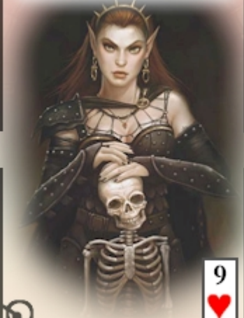
Life and Death