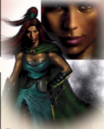
The Gregarious Neighbor